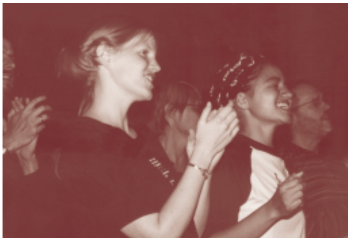
Faith in Action, praying and singing in Jubilee

The theme of Jubilee runs deep in Scripture. God's identity as liberator is fundamental (Ex. 20:1-3; Deut. 5:6-7). A good case can be made that the Bible actually considers Jubilee non-negotiable—if people do not obey, the demands of Jubilee justice remain outstanding until fulfilled, regardless of chronological time. Leviticus 26:34-35 says the land will take her Sabbath even if we humans ignore God's word. Prophets and leaders regularly called Israel to account for neglecting the demands of the Sabbath and Jubilee texts (for example, Nehemiah 5:1-13; Jeremiah 34:8-18; Amos 2:6-7, 8:5-6; Ezekiel 18: 7-9, Isaiah 58). Whether the Sabbath and Jubilee Years were ever adequately observed is a secondary question for the prophets—we are called to accountability, irregardless.