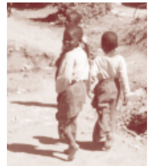
Compound in Lusaka, Zambia where there are growing numbers of orphaned children.