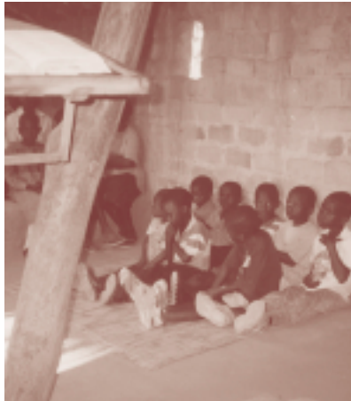
LEFT: Children attending rural church in Zambia.

The factors contributing to Zambia's plight are varied and complex, but austere economic reforms attached to loans play no small part. Structural adjustment measures implemented in the 1990s