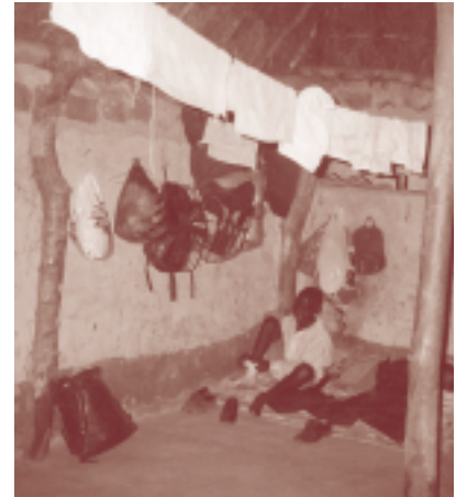
RIGHT: Boys quarters – Nyaphonde Community School and Orphanage in rural Zambia. Orphanage built by local church, communities and missionaries from the U.S. Serves over 250 children, but only able to feed and house 30-35 children.

called for widespread privatization of parastatals, liberalisation of exchange and trade and cost-sharing schemes in health and education services. These contributed to (among other things) currency devaluation, high unemployment, and reduced expenditures on health and education. In 2000, the Zambian government spent close to $170 million on debt servicing compared with less than $150 million on health and education combined. Debt service has on average accounted for 10 percent of GDP while expenditures on social services have accounted for 5%.