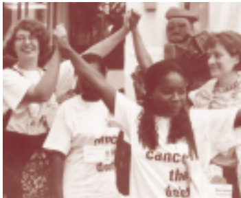
Joining hands to cancel the debt!

Join the work of Jubilee debt cancellation right in your hometown. Here are suggested actions for your local Jubilee coalition, faith community or family for every month in the coming year. In 2002, help us say “debt is not done!” by pushing legislation, raising awareness in the media and bringing thousands of your