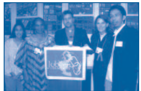
TOP: The Coalition for Christian Outreach hosted events in Pittsburgh for the “Drop the Debt” Invest in People” tour, October 2005